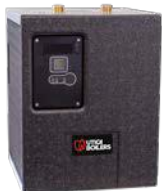
DHW Module 550003792U

Beckett or Riello Burner; Manual Reset High Limit with plug-in Molex connector, and Direct Vent (Direct Vent not available on TRB4090); DHW (Domestic Hot Water) Module Available (Sold Separately)